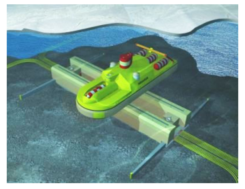
Figur 3 Underwater nuclear powered drillship.